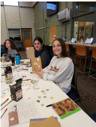
Students personalizing journals

Welcome back from Spring Break. Wouldn't it be great if we all were able to rest and come back to work ready to conquer the retention problems? However, for many Otero College employees, we still had lots of non-work-related obligations to complete and having a break only gave us the opportunity to catch up. The good news about that is, it is always great to get things done and the change from routine allows us to reboot and refocus. The AIM Program staff were no different. During Spring Break, they attended a conference in beautiful California and brought back some great ideas to share. Here is a look at what the AIM Program staff brought to Otero College in March.